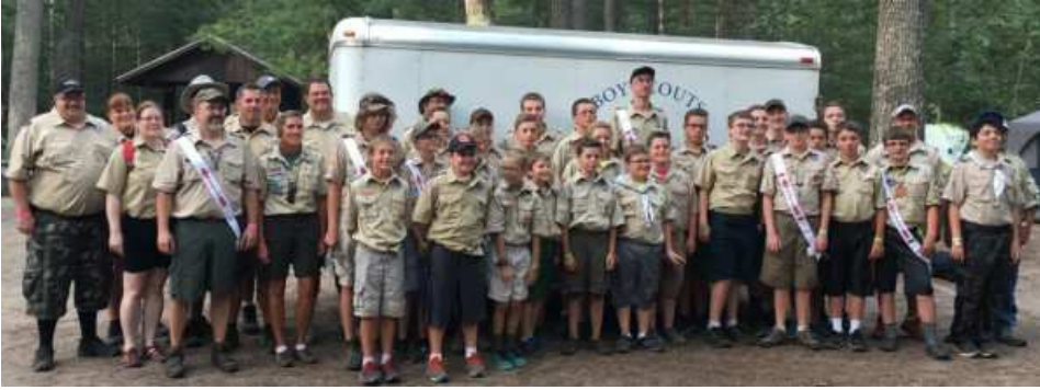
Scout Troop 202

Troop 202 attended Summer Camp at Gerber Scout camp this July. Gerber Scout Camp is in Twin Lake, Michigan and is located inside Manistee National Forest. The first official summer camp program began in 1951. The land of 800 acres was acquired by the Michigan Cross-roads Council through a gift from Dan Gerber, president of the baby food company. Every summer, scouts from all over come to Gerber for a weekly session of camp which includes fun and hard work. The bulk of each day at camp is for scouts to attend Merit Badge classes. If a Scout attends all five sessions of Merit Badge classes, then they will have completed five Merit Badges by the end of the week. There is also swimming, free time, family night and firebowl ceremonies on the lake front. Each troop sets up camp at a campsite on the grounds and spends the week together as a troop. There is a nice dining hall where we eat our meals together. During the day, we each go off to our merit badge classes, and then come back together in the evening .